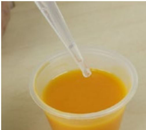
Adding Cell Flow to mixed colour. Approx. 1-2 drops per 30 mL of prepared colour.

Tri-Art Cell Flow Medium is sold separately from sets.