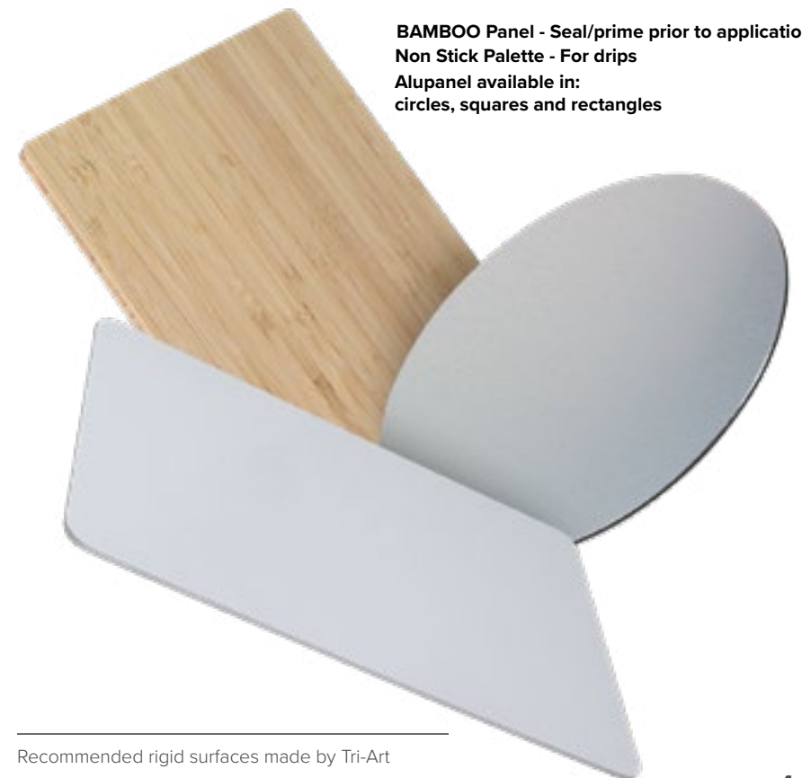
BAMBOO Panel - Seal/prime prior to application Non Stick Palette - For drips Alupanel available in: circles, squares and rectangles

A large cover, like an inverted box on top will prevent dust and reduce the danger of bumping... or curious pets.