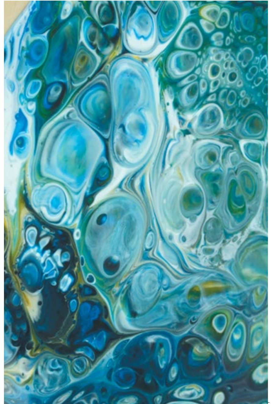
The effect of cell flow medium in a paint pour.