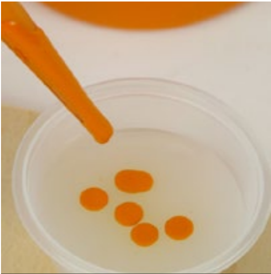
Adding Tri-Art liquid colour to pouring medium. Approx. 1:20 (colour:medium)

Pouring medium may be tinted with colour or used as a clear, very glossy layer or finishing coat.