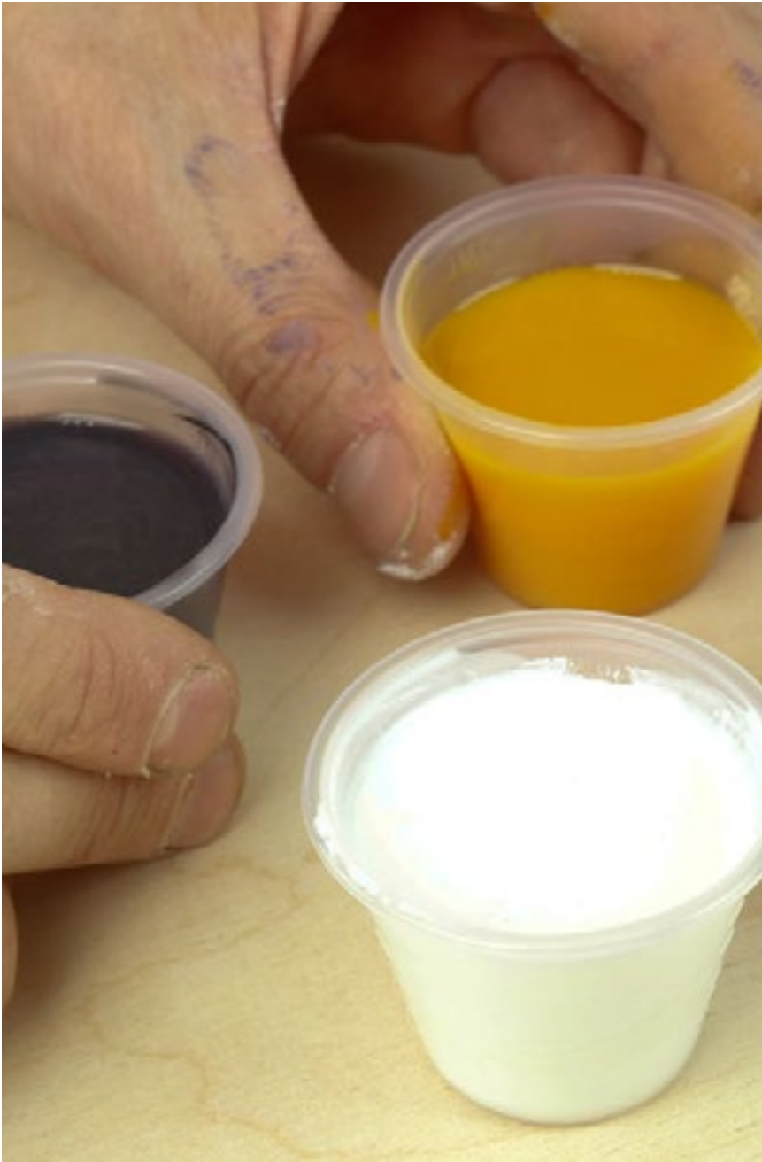
Pouring colours mixed with liquid glass pouring medium.